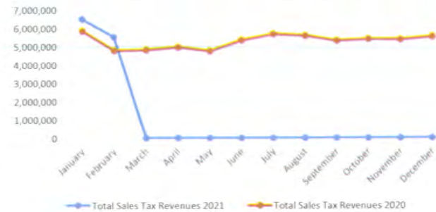
Monthly Sales Tax Revenues 2020-2021

Source: State of Arkansas Treasurer's Office Monthly Sales Tax Funds Distribution Note: The monthly data reported is the amount distributed by the state. The month reported is the month revenue is collected by the State. Distribution to cities is made the following month.