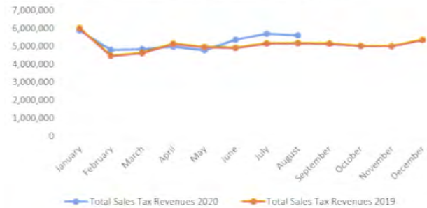
Monthly Sales Tax Revenues 2019-2020

Source: State of Arkansas Treasurer's Office Monthly Sales Tax Funds Distribution Note: The monthly data reported is the amount distributed by the state. The month reported is the month revenue is collected by the State. Distribution to cities is made the following month.