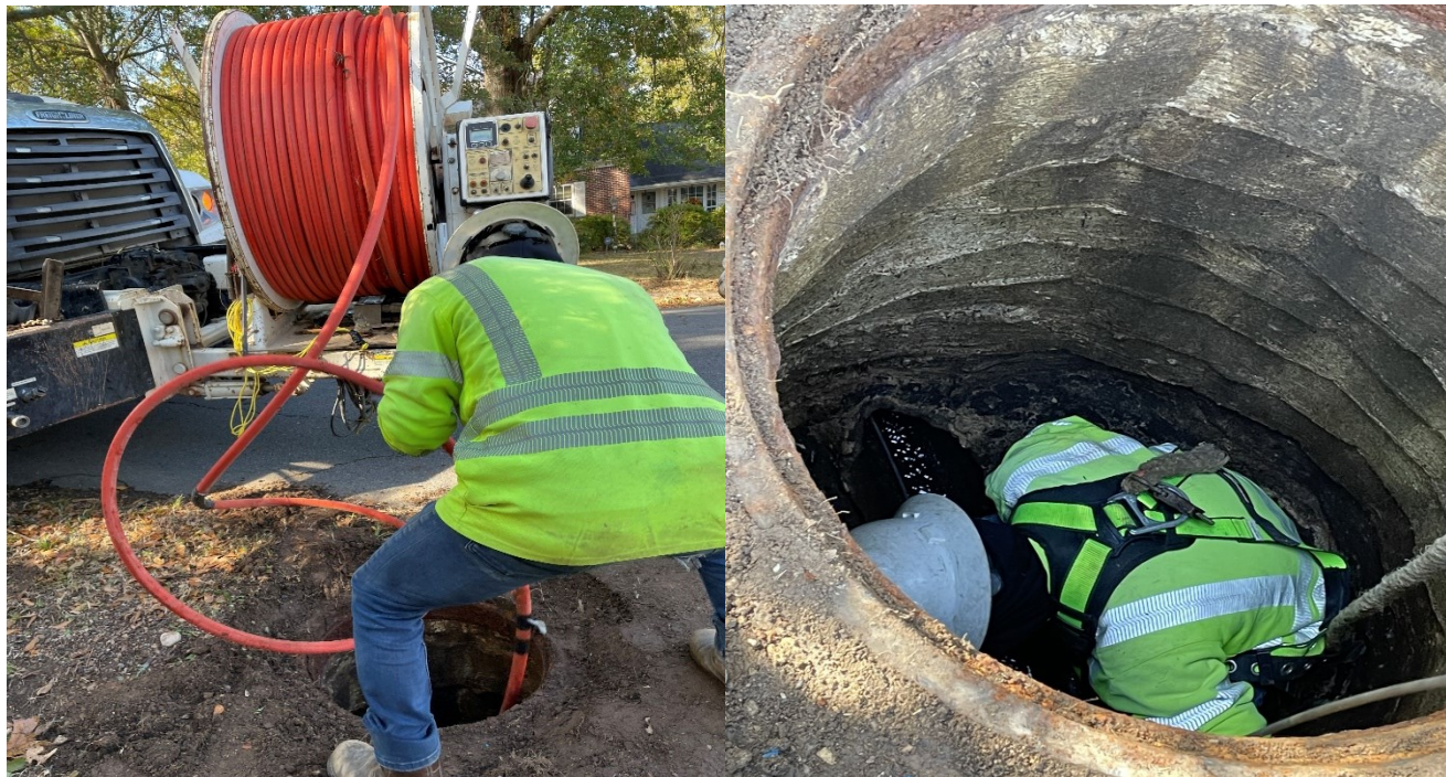
PRE-REPLACEMENT CLEANING WORK IN SANITARY SEWER LINE