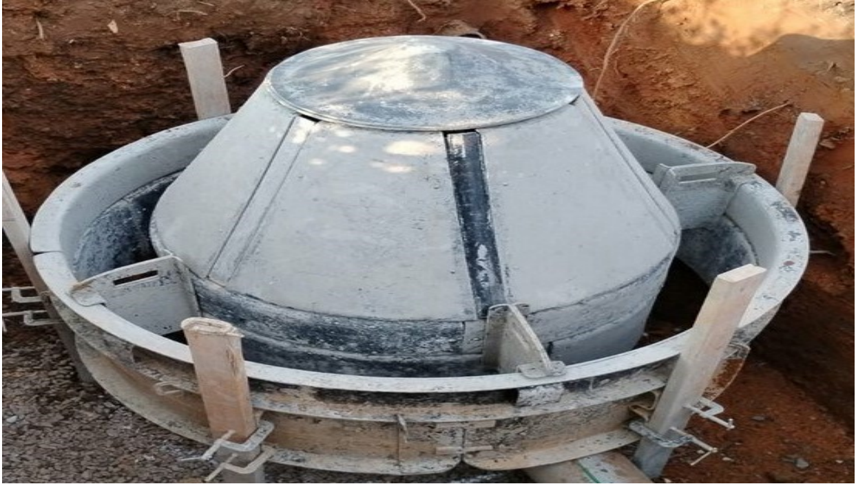
CAST-IN-PLACE MANHOLE CONSTRUCTION PROCESS