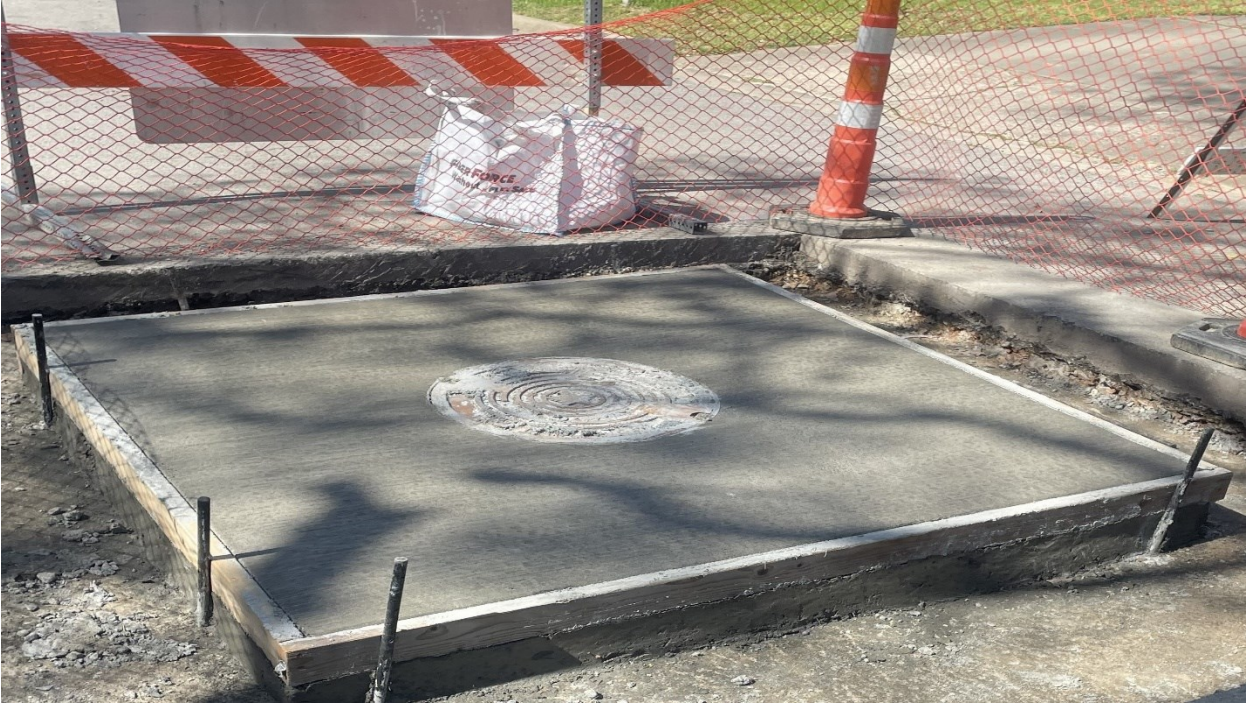
CONCRETE CAP FOR MANOLE PROTECTION