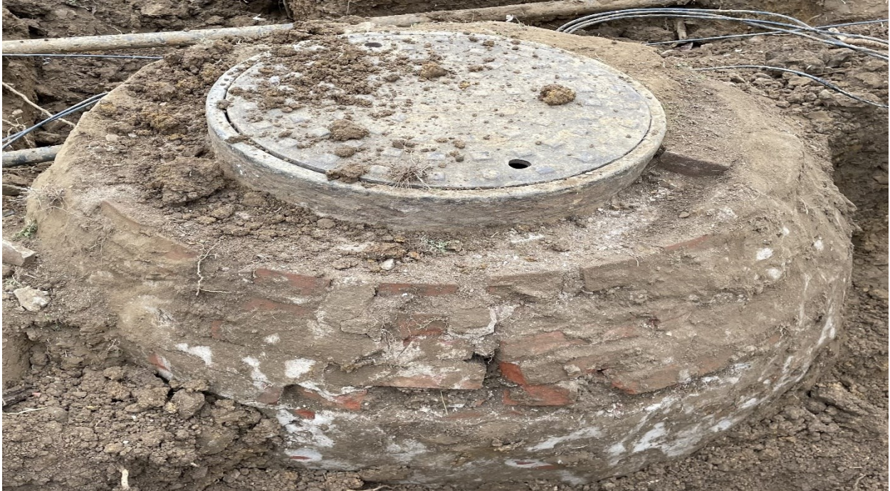
OLD BRICK MANHOLE