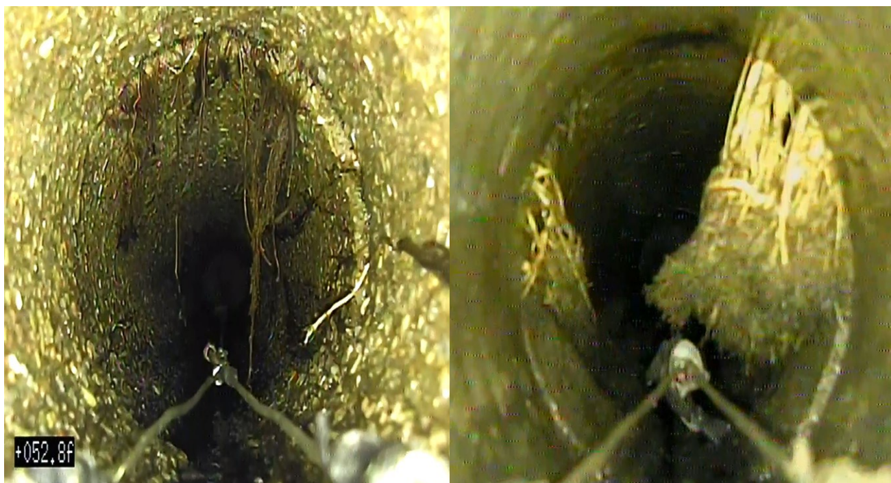
PRE-REPLACEMENT CCTV INSPECTION