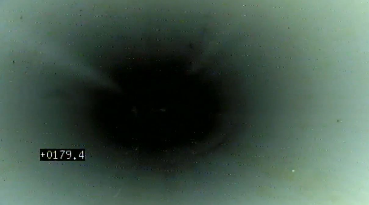
POST-CCTV SEWER MAIN LINE